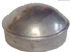
Dome Cap for 2-3/8" round post ksi#HCC250