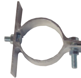
TSA2X116 with hardware for 2-3/8" round post to mount one sign ksi#HTSA2X116