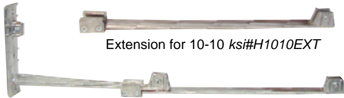
Extension for 10-10 ksi#H1010EXT