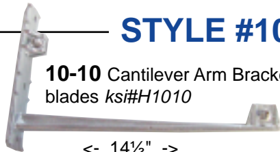
10-10 Cantilever Arm Bracket for flat or extruded blades ksi#H1010