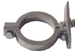
318S with hardware for 2-3/8" round post to mount one sign ksi#H318S